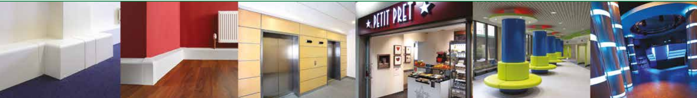
pipe boxing and casings for services